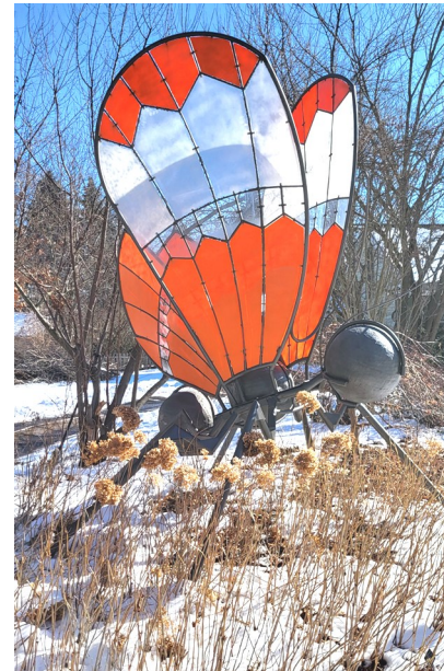
10. Iron Butterfly Josh Wambaugh

Funding for the Art Walk sculptures have been made possible through the generosity of numerous White Lake community members, the cities of Whitehall and Montague, civic and corporate sponsors, and grants. The sponsors are listed at each sculpture site. We hope you enjoy the trail!