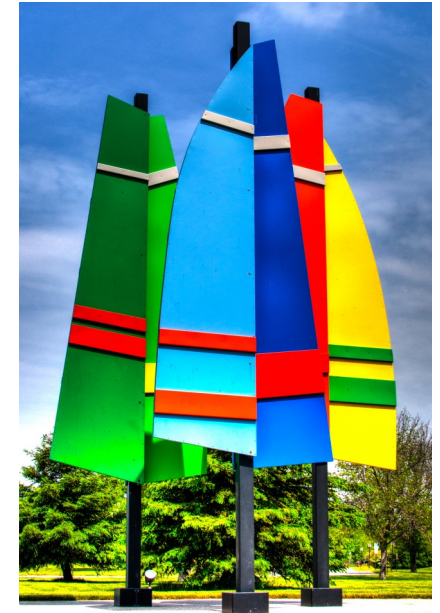
4. Sailboat/Trees George Ramsay