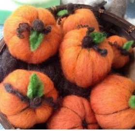
Needle Felting- Pumpkins Ages 12-Adult