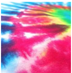
Teen Open Studio: Tie-Dye Ages 12-18