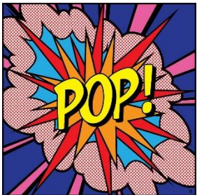
Pop Art Exploration Ages 4-8