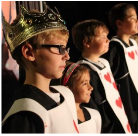
Alice's Adventures in Wonderland Grades 1-12