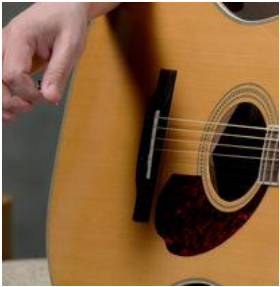
Intro to Guitar Ages 12-Adult

Come make a T-shirt to take home with you and make extras to sell in the gallery. Part of the proceeds from the T-shirt sales will go back to you (the artist) and the rest will go to supporting art education.