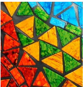
Friday Drop-in Ages 12-Adult